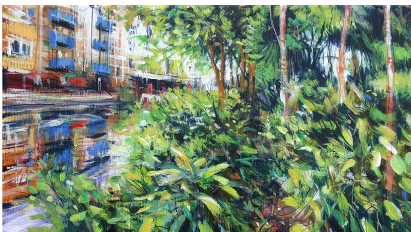
'Meanwhile Gardens, Kensington. 28 09 16' Below